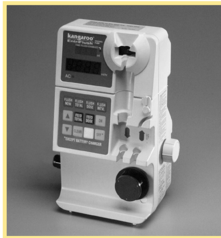
Figure 2: KANGAROO Entriflush (Kendall/Tyco Healthcare)

Many patients aspirate without overt symptoms; detection is key to both preven-